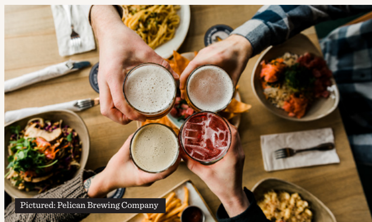
Pictured: Pelican Brewing Company