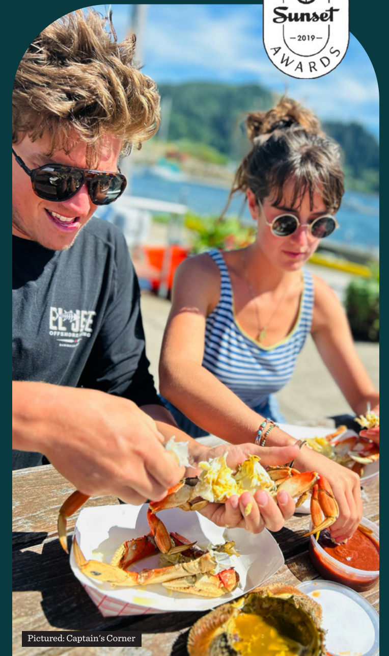
Pictured: Captain's Corner