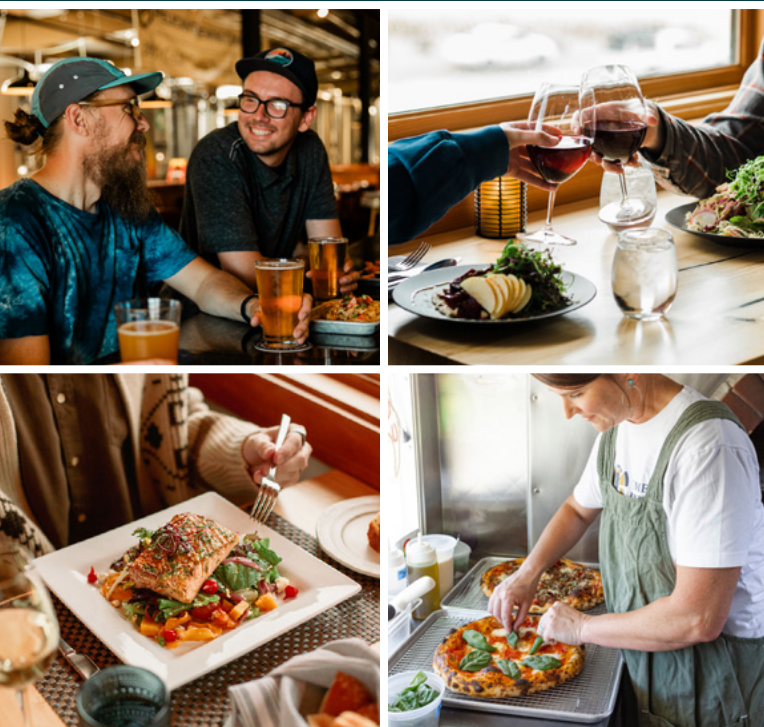
Pictured above: Pelican Brewing Company, Meridian Restaurant & Bar, and Fornax Pizza

FRESH SEAFOOD ARTISAN CHEESE CRAFT BREWS